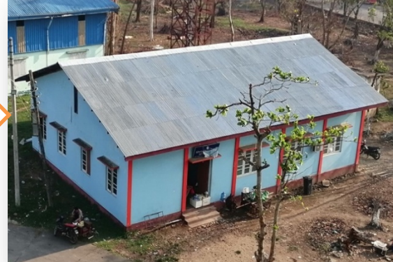
Developed by Department of Public Health, Ministry of Health