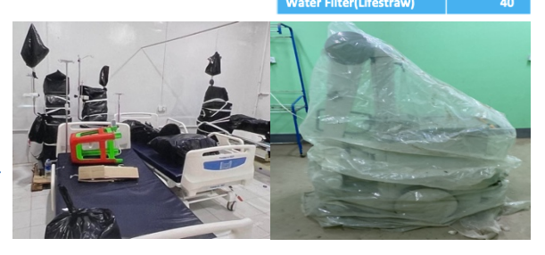
Renal Dialysis Machines ,Medicines and X Rays Machine were protected