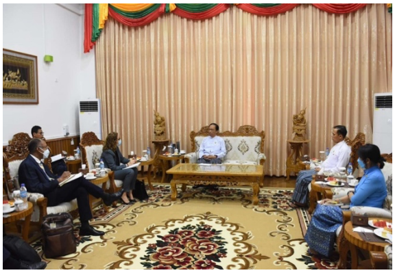
Union Minister for Health discuss with Rep. from UN Organizations